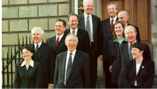
1999 – Donald Dewar's first Cabinet – as Minister for Environment, Planning & Transport (far right in photo)