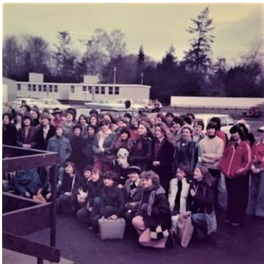
1978 - Choir departs from School playground for Florence